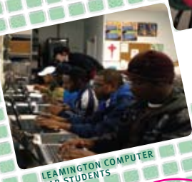
LEAMINGTON COMPUTER LAB STUDENTS