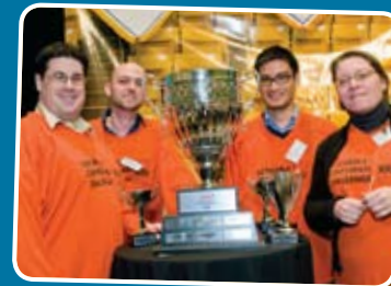
2010 SCRABBLE® CORPORATE CHALLENGE WINNERS, THE CNW NEWSMAKERS, CELEBRATE THEIR WIN OF THE TMX CUP.

Since 2005, this unique event has raised over $1 million for Frontier College and its important mission to improve literacy across Canada.