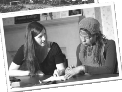
Bottom: A Frontier College tutor working with a student.

"We are honoured to have the confidence of the Laubach Literacy of Canada staff and board and we look forward to working with the Laubach network, councils, trainers and tutors across Canada. We will move ahead with the knowledge that we will keep the legacy of LLC alive and vibrant and we truly hope that the membership of LLC will join with us to ensure that these legacies live on."